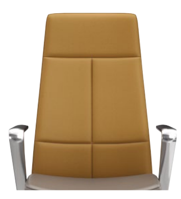
QUILT STITCH BACK