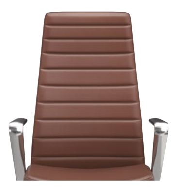
CHANNEL STITCH BACK