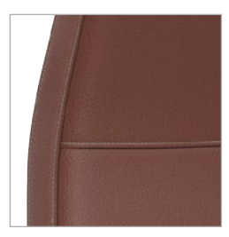
CONTRAST STITCH Includes additional top stitches which are available in a variety of color options for an elevated look.