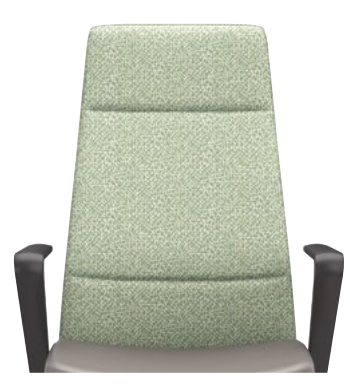
SOLID STITCH BACK