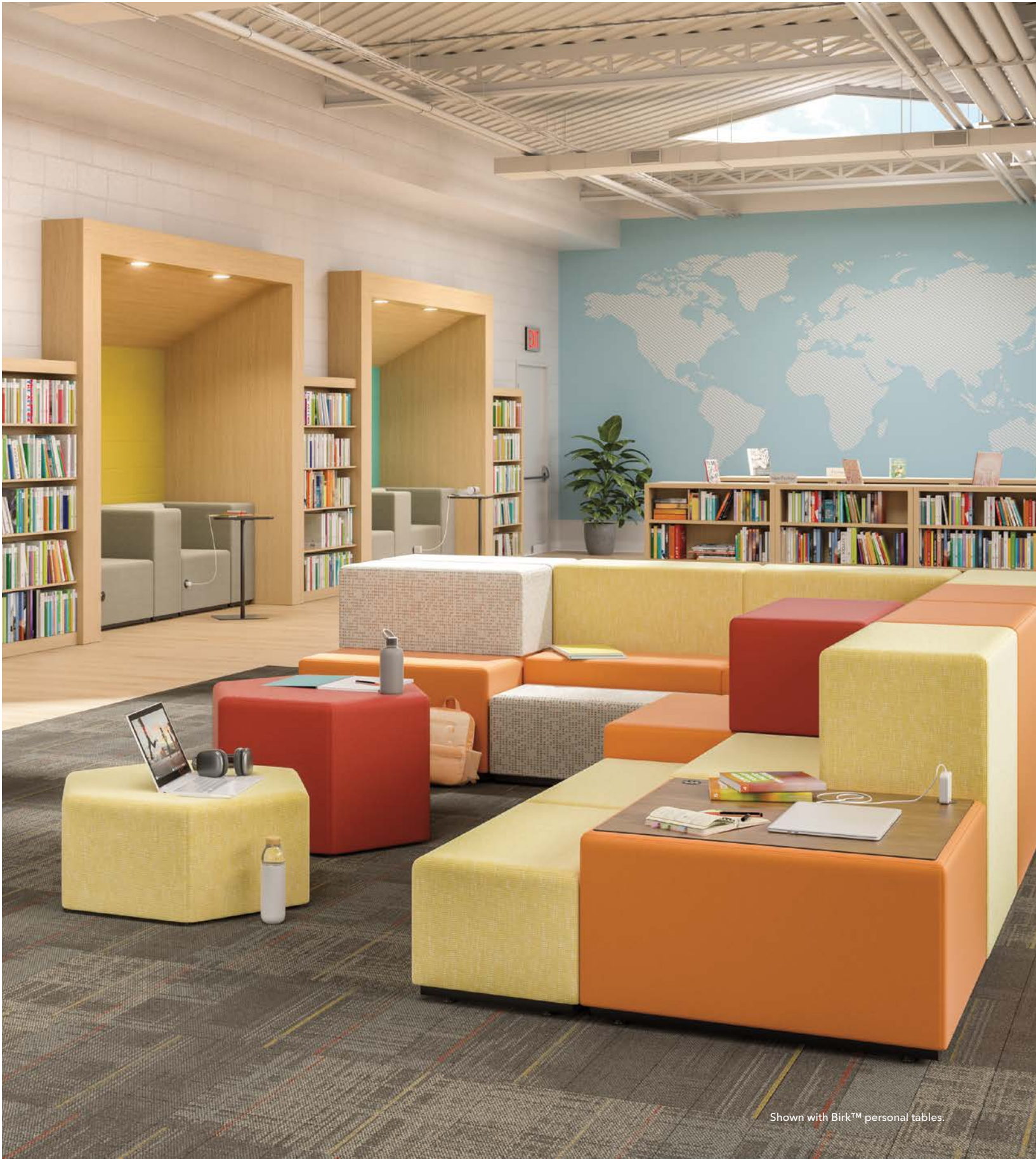
Shown with Birk™ personal tables.