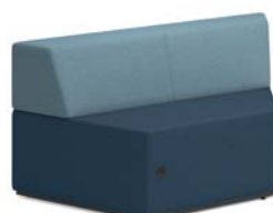
Low-Back Trapezoid Seat