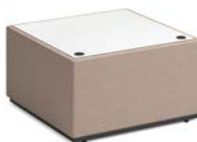
Square In-line Table