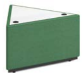
Triangle In-line Table