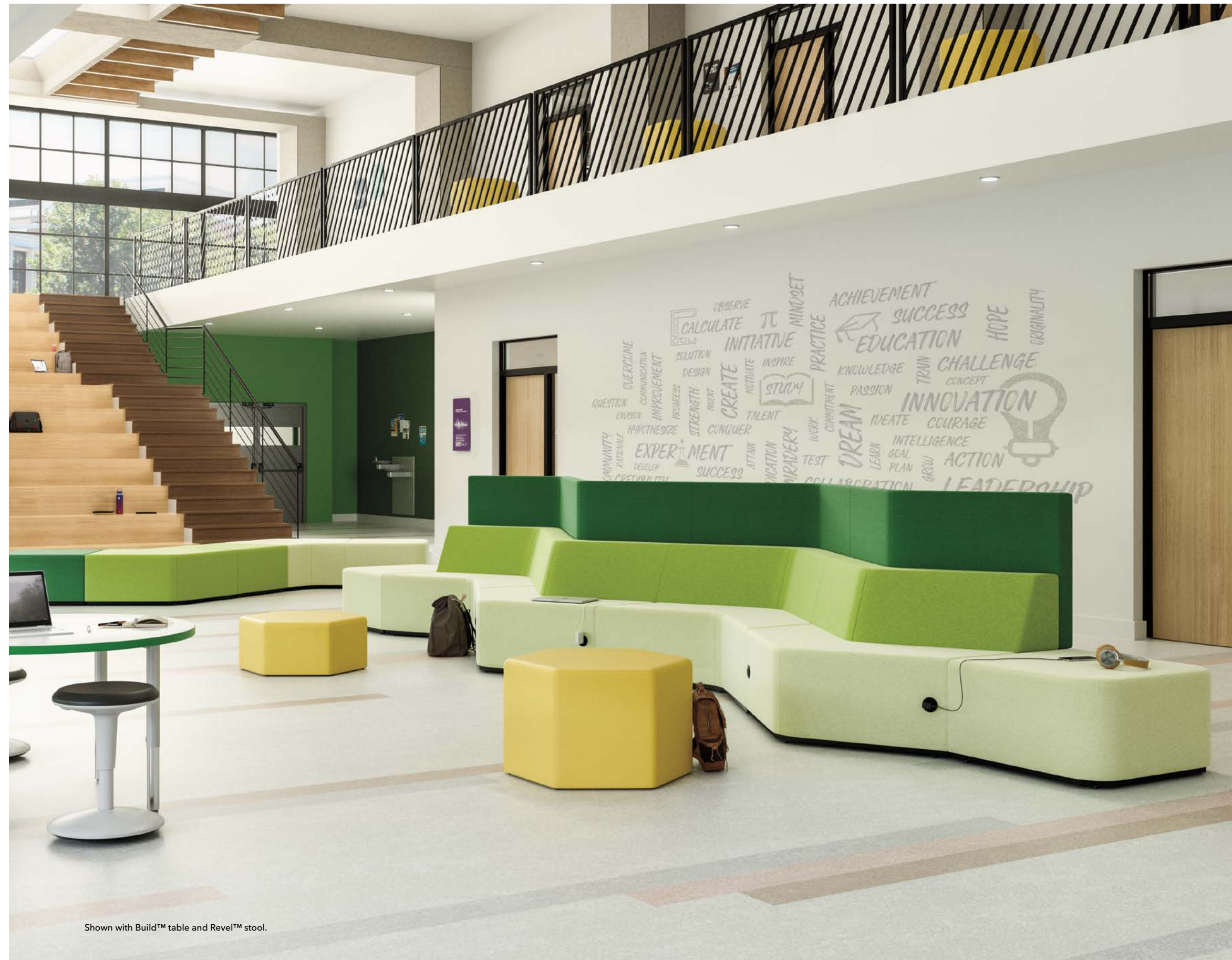
Shown with Build™ table and Revel™ stool.