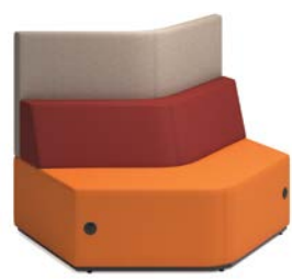
High-Back Arrow-Out Seat

With 27 easily configurable shape and size options, Tangram offers the ability to create custom layouts that breathe new life into unconventional learning environments no matter what the lesson of the day might be. And with its single or multi-fabric options, rainbow of color choices, and playful aesthetic, this solution puts the “fun” in functional.