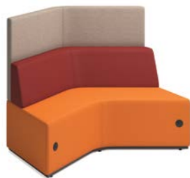
High-Back Arrow-In Seat