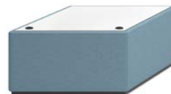
Diamond In-line Table