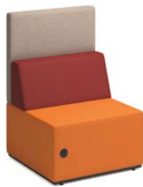
High-Back Square Seat