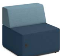
Low-Back Square Seat