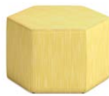
Varsity Hexagon Pouf