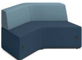
Low-Back Arrow-In Seat