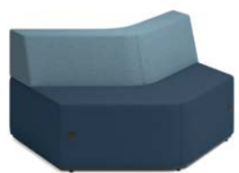
Low-Back Arrow-Out Seat