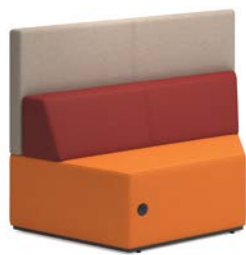
High-Back Trapezoid Seat